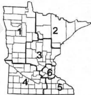
MN Chapter TWS Regions