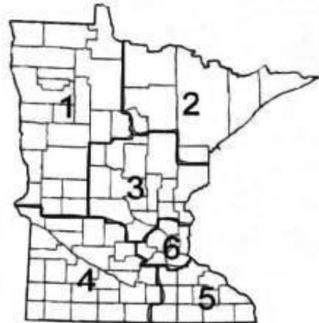
MN Chapter TWS Regions

NEXT NEWSLETTER DEADLINE: MARCH 15, 2011.